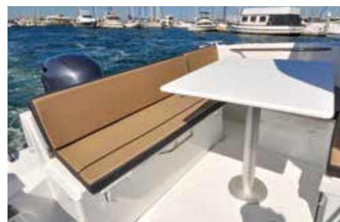
Jeanneau has cleverly used available space to ensure maximum usability for passengers.

It seems that the whole trailerboat world is morphing to trawler-style cabins with upright windscreens, and this includes many of the Merry Fisher models. Call me old school, but I still like the sleek looks of a sweeping windscreen, and this Jeanneau design maximises the cabin's internal efficiencies.