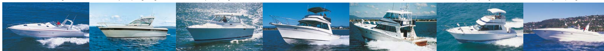
1989 - 44 Diavalo