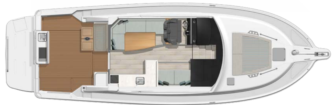
Optional cockpit teak deck shown