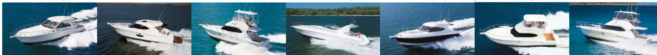
2008 - 48 Offshore Express