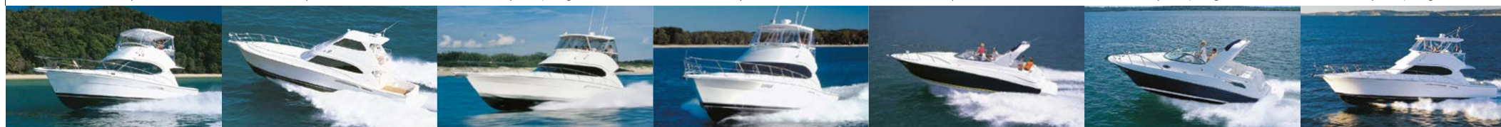
2004 - 33 Open Flybridge