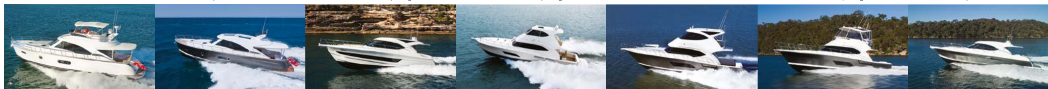
2012 - Belize 54 Daybridge