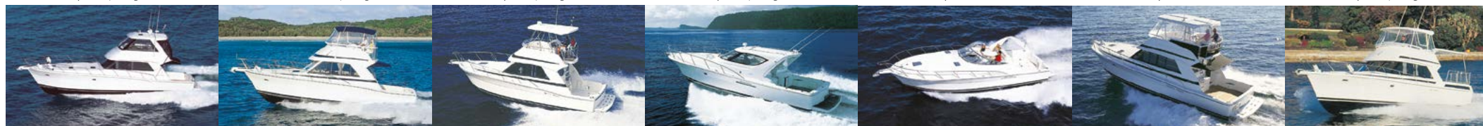
1998 - 48 Enclosed Flybridge SII