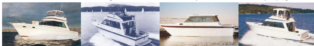
1983 - 44 Open Flybridge