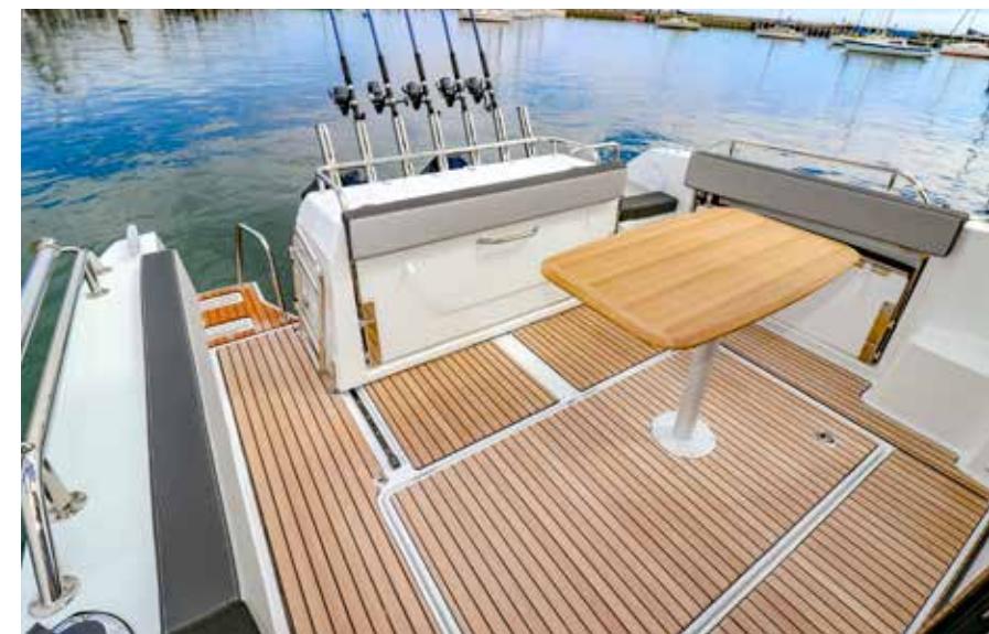
Below: For fishing, just remove the cockpit table and fold up the seats.

There was a bit of bow-lift in the unloaded boat at a Wide Open Throttle of 5700rpm, where we achieved a speedy 37 knots (68.5km/h) using 65lt/h each side. That is more than enough for a boat of this style, and certainly lots of fun at the helm. She cops a bit of windage when