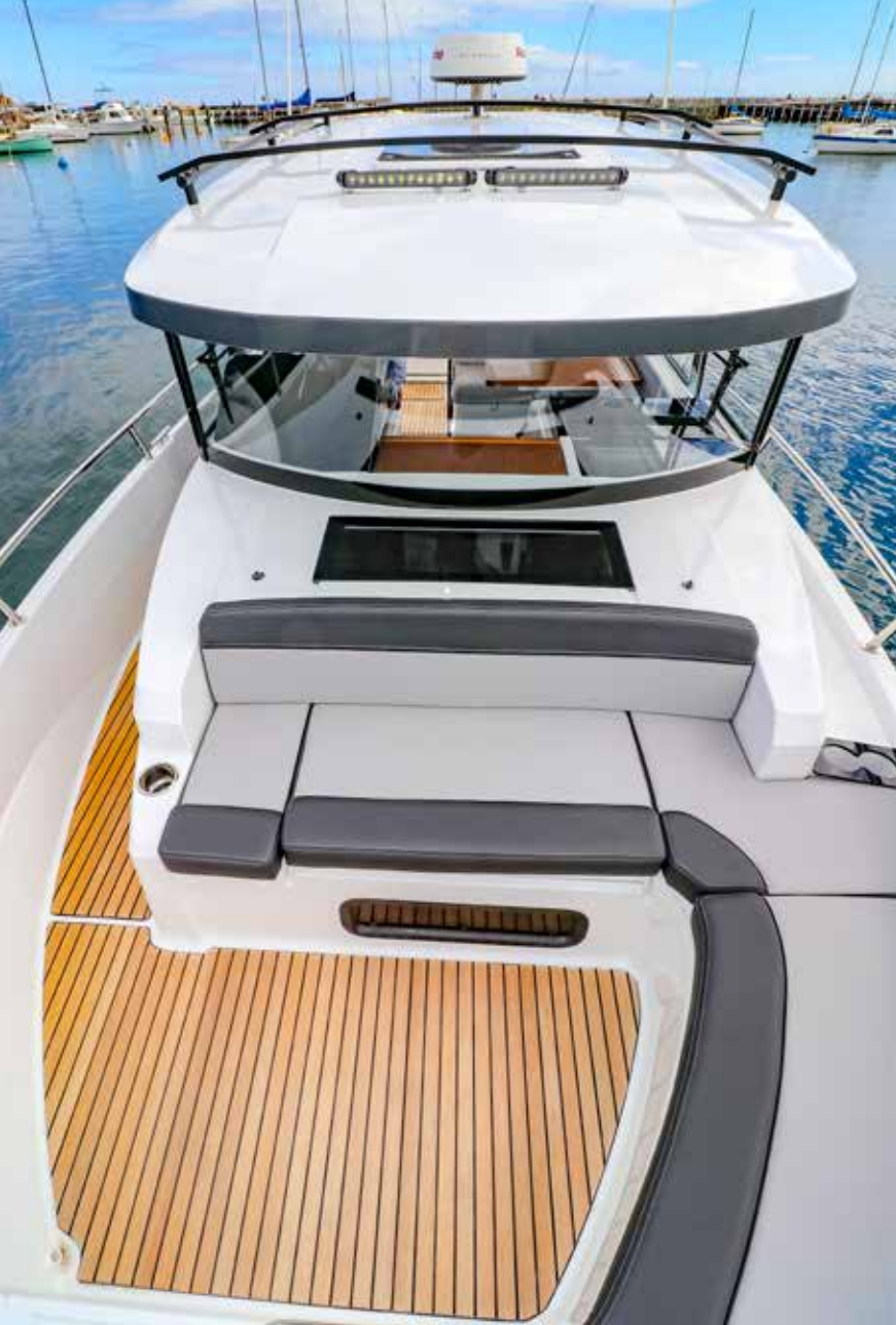
Above: The 895 has an asymmetrical footprint to port, creating a full walkaround starboard side deck.