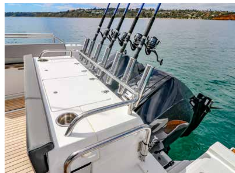
Below: Transom bait station boasts a seven-pot rod rack.

flooring and a matching cockpit table that could be removed or replaced with a leaning post/work station if serious offshore fishing is your forte.