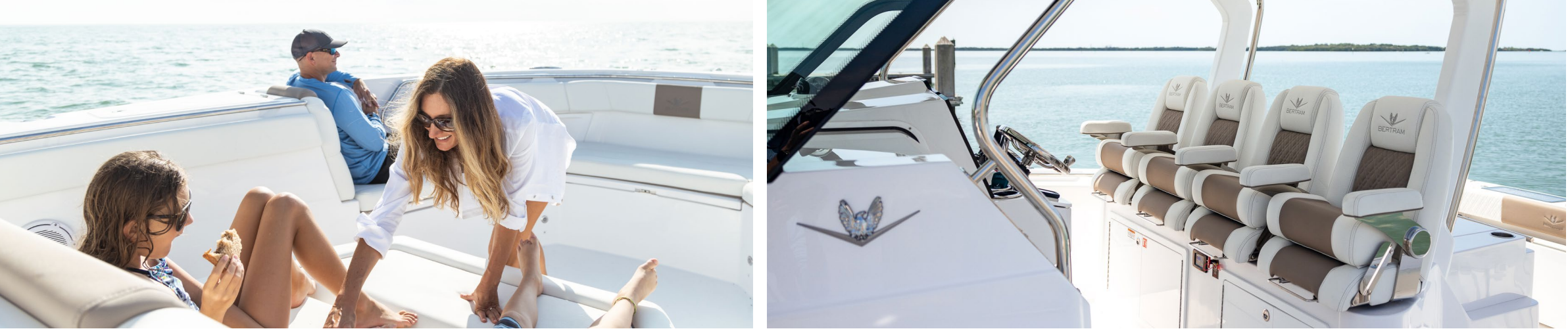
Dune upholstery package shown above.

Our CC line is back in a big way with a boat designed to provide superior performance for serious fishermen. Incredibly stable and comfortable rain or shine, your friends and family are sure to enjoy the ride.